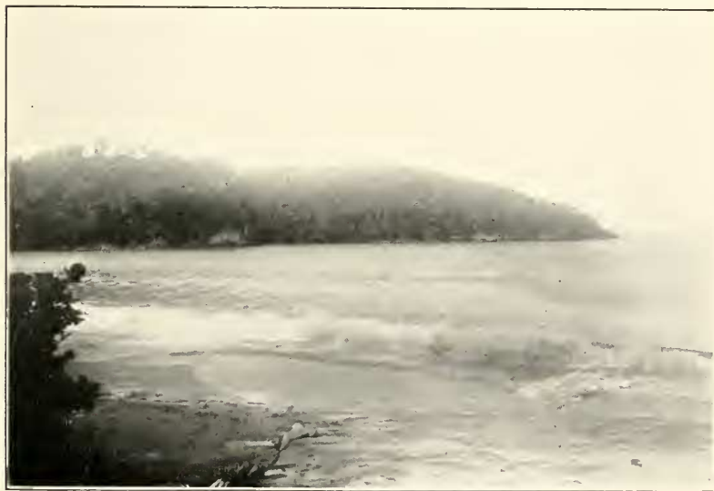
BAY AT WESTERN END OF ÎLE À VACHE. Haiti, April 30, 1931